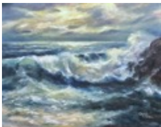
An Oil Painting done for her Grandma in 1982