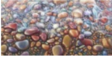
Ebb and Flow 24x48 Oil Painting