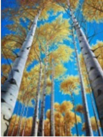
High Hopes 36x48 Oil Painting

the story of her Art and the prevailing direction that is exhilarating her. “I have spent quite a few years working in a realistic style.