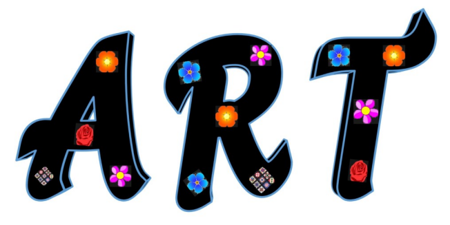
By Adults with Intellectual Disabilities